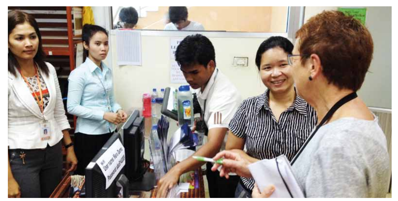
Librarians from the Raoul Wallenberg Institute visit the PUC library

Note: Application forms for both admission and scholarship are available at PUC Legal Clinic.